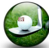
Zonta Club of Quaboag Valley Annual Golf Tournament Fundraiser

Our 22nd Annual Golf Tournament will be Saturday, September 10th at Mill Valley Golf Links.