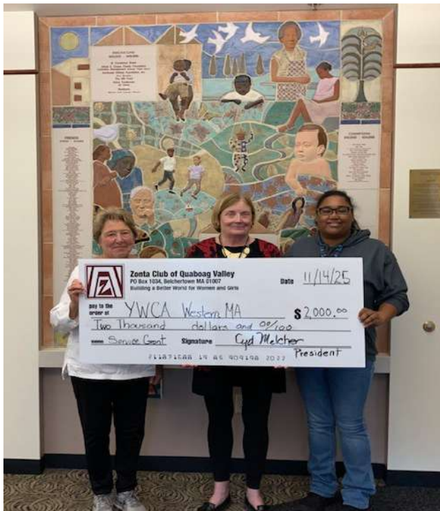
The YWCA of Western MA received their Service Grant money from Quaboag Zonta for establishing a food bank for women and children in need during these difficult times.